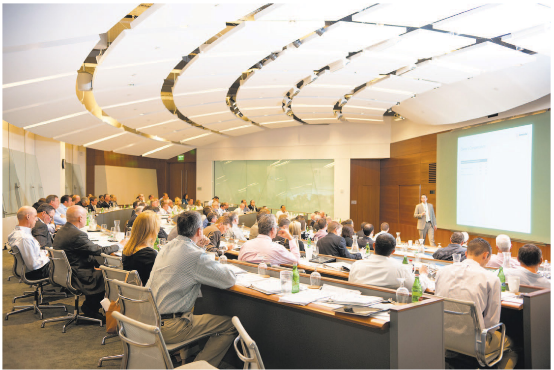
More than 100 advisors came to Dimensional's Austin, Texas, headquarters for two days of seminars.

Advisors selling DFA funds have monthly or quarterly meetings with one another, facilitated by a DFA manager, to discuss portfolio and practice manage-