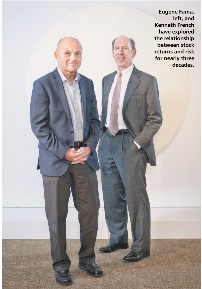
Eugene Fama, left, and Kenneth French have explored the relationship between stock returns and risk for nearly three decades.

The basics of market efficiency are often misunderstood. Some say that if factors such as a stock's value, size, trading momentum, and profitability—all of which are part of your multifactor model—indicate outperformance, then the market isn't really efficient.